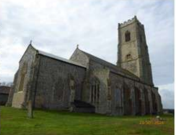
St, Mary's dates from 15 th century. the Norman church was completely rebuilt in the 14 th century and the 14 th century church, was itself rebuilt in the 15 th century only the chancel was spared and then it was extended and heightened. In the churchyard is a memorial to the crew of HMS Peggy that ran aground here on 19 th December 1770 a total of 32 members of the crew are buried here. On the north side of the churchyard is a large mound marking a mass grave of 119 crew members of HMS invincible which came to grief on Haisbro sands in 1801.