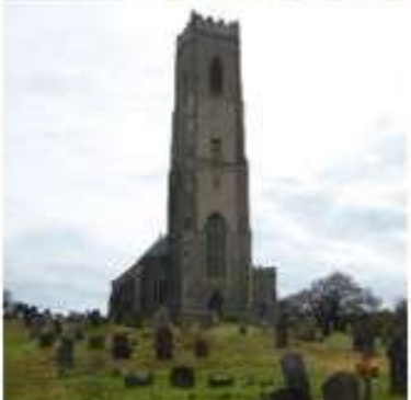
St, Mary's tower dates from 15 th century is 110 ft tall. has a ring of 8 bells with 10-0-22 cwt tenor, in Ceorge's words "don't she stand proud"?